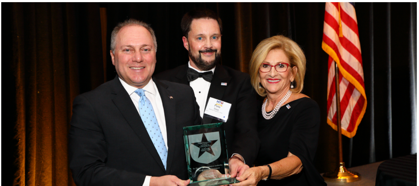
NTU & NTUF YEAR IN REVIEW 2019